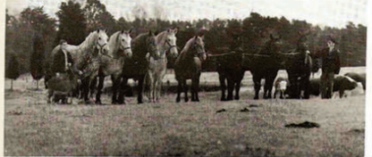
Present herd of mares at Rolling Hills Percherons.